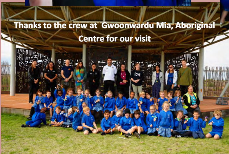
Thanks to the crew at Gwoonwardu Mia, Aboriginal Centre for our visit