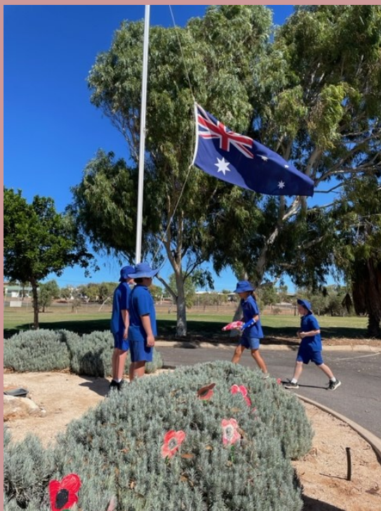
Year 5 laying down their wreath.